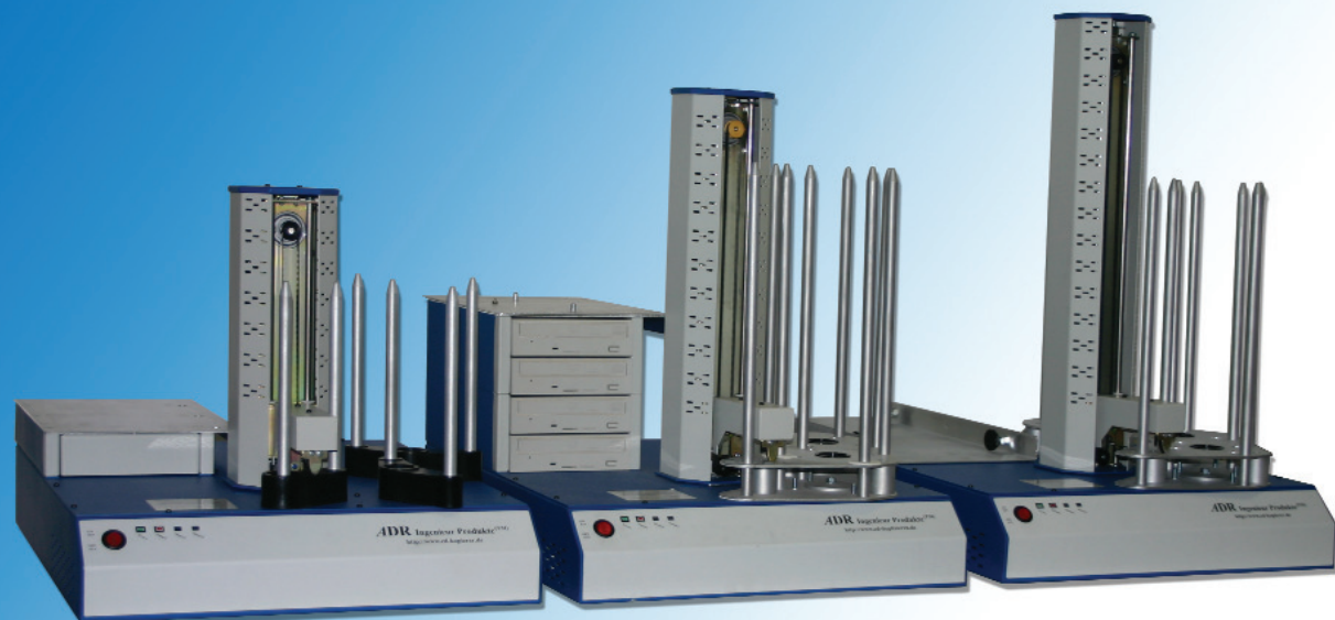
HURRICANE 125-375 DISCS